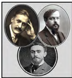
Armistice Day Concert: Music of the WW I Era