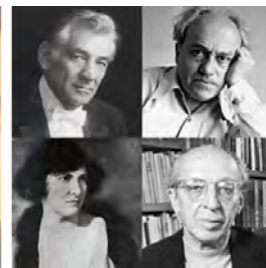
New York Jewish Composers