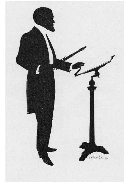
GEORGES BARRÈRE FOUNDER