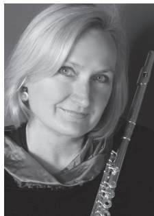
From the President