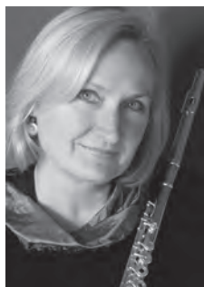
From the President