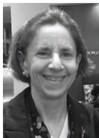
From the President