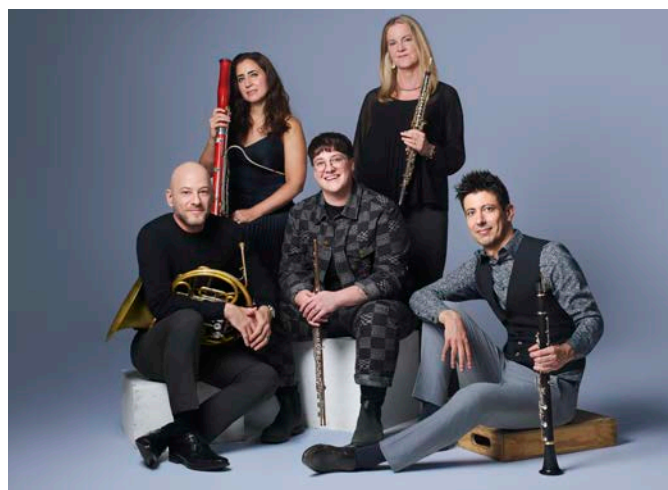
Sylvan Winds, one of many groups playing Feb. 8, will be performing a Ruth Crawford-Seeger quintet.